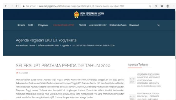
Figure 2. Open Selection Announcement on BKD DIY Official Website