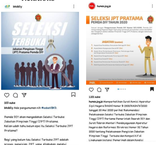
Figure 3. Announcement of Open Selection on Official Instagram of BKD DIY and DIY Public Relations