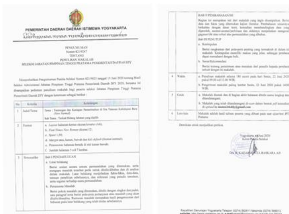
Figure 7. Information Related to Writing Papers Online