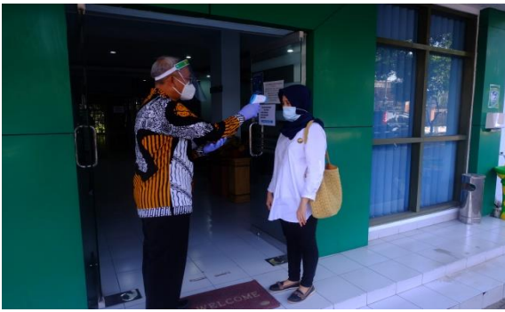
Figure 6. Implementation of Competency Test